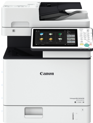
imageRUNNER ADVANCE 715iFZ III (Finisher Model)